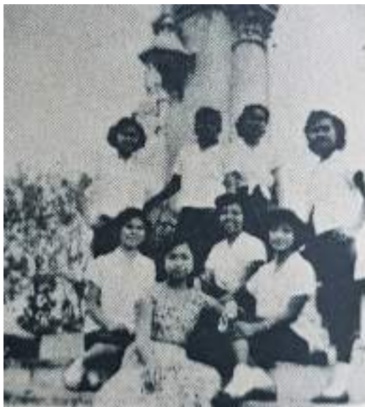
Minerva monument at the background