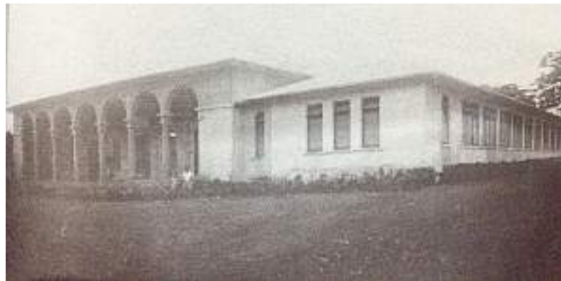
Rizal Hall (Juan Arellano Gabaldon-type building)