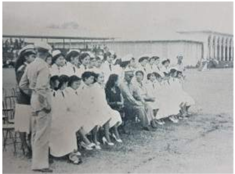
Rizal Hall at the upper right corner